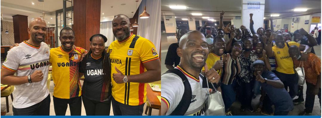
The Smellies' and Atohengbes' got an exciting greeting in Lagos!

On January 17th, the Atohengbes, Deji and myself boarded the plane for Lagos, after “tearing ourselves” away from the valiant disciples of our East African family. After arriving around 11PM and waiting about 1.5 hours for my Visa-on-Arrival, the Lagos disciples greeted us with singing and dancing at 12:30AM in the morning!