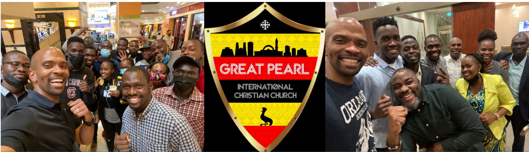
God is moving in Uganda as the Great Pearl International Christian church is on the move with a new logo and new fired-up interns!