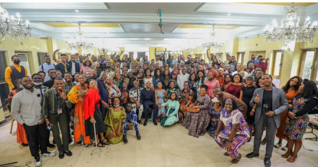
The incredible saints of the Lagos International Christian Church!