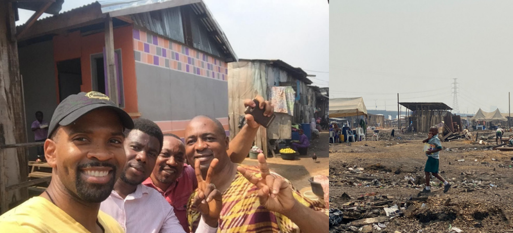
The original wooden structure of “The Real School” back in 2018

Just recently, the original wooden school was completely burned down by another fire and 40 families from the school were displaced. Thankfully, the Real MERCY School continues to bring joy to these children through education and a warm meal to their tummies! It was very unsettling to also visit the burned Okobaba area, yet the smiles on the faces of the students as they left the Real MERCY School to return home reminded us of the impact that MERCYww is having in these young lives. Please pray as we are working to develop a school library and computer room for these 100 students!