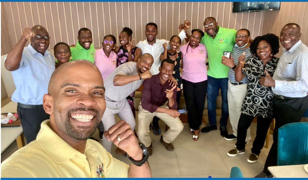
The mighty staff of the Lagos International Christian Church!

It was a joy to meet with the Lagos Staff later that morning as I preached a lesson entitled, “United in Mind and Thought.” I encouraged the Staff to expect a complete unity of commitment and service from the church as it prepares to send members to help plant the Kampala Church this year and provide most of the team members to plant Accra, Ghana in 2023! It was exciting to dream together to raise up new interns and Shepherds-in-Training for this great church!